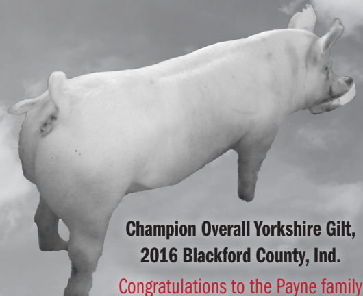
Champion Overall Yorkshire Gilt, 2016 Blackford County, Ind.